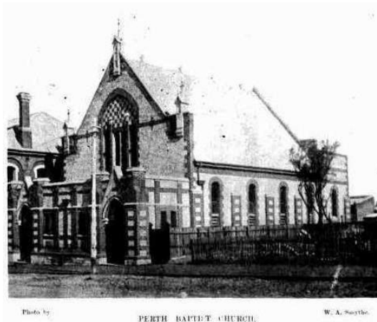
Baptist Church, Perth ( Western Mail , 18 August 1899, p.35)