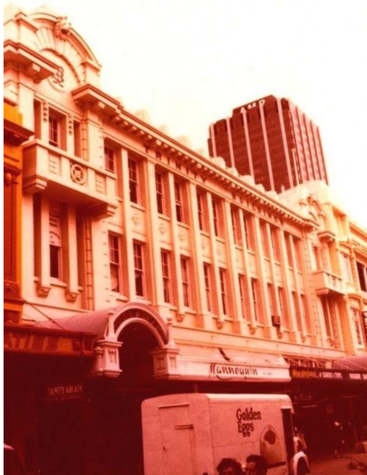
Trinity Buildings, 671-681 Hay Street, Perth of 1926 (NTWA)