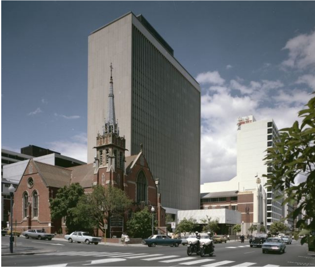
St Andrew's Presbyterian Church, St George's Terrace Perth of 1906 (1971,)