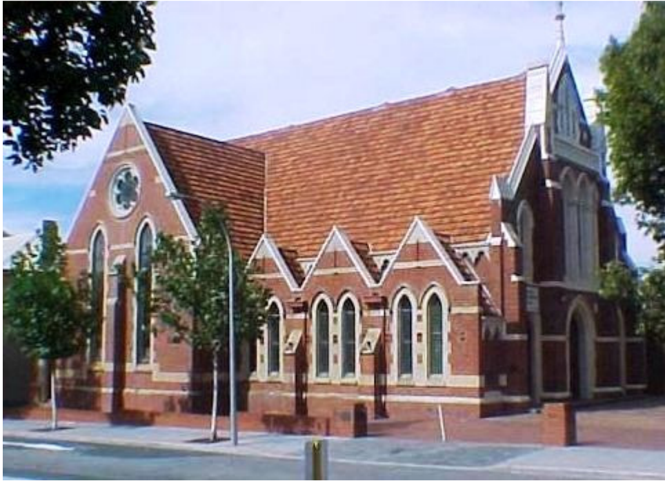
Ross Memorial Presbyterian Church, corner Colin and Hay Streets, West Perth of 1916