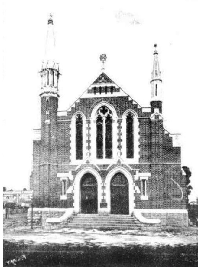
Congregational Church, Subiaco ( Western Mail , 30 June 1906, p.25)