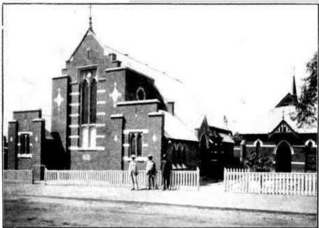
THE NEW PRESBYTERIAN CHURCH IN RAGLAN-ROAD, NORTH-PERTH—THE OLD CHURCH IS SHOWN IN THE PHOTOGRAPH.