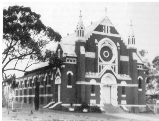
Methodist Church, Northam of 1901 (Molyneux, Ian, Looking Around Perth , 1981, p.113)